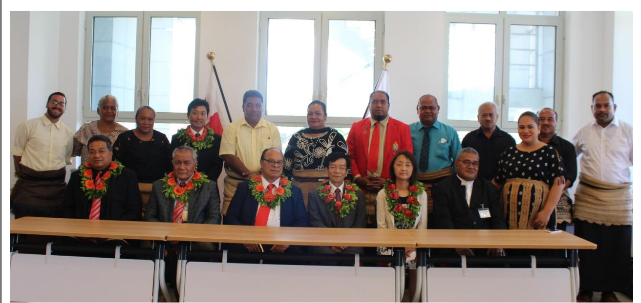
The signing ceremony for Japan's GGP project at the Ministry of Finance, 15 March 2018.