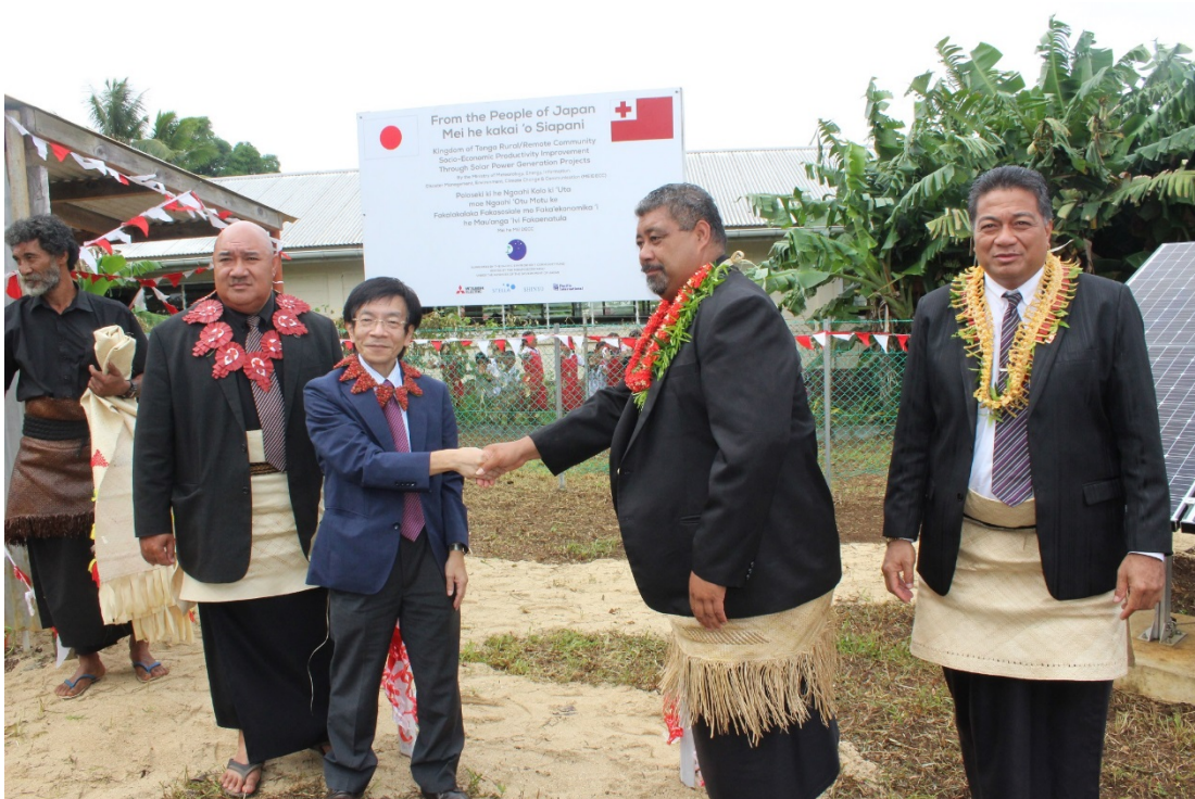
The Commissioning Ceremony for the PEC project in Pangaimotu, Vava'u on Thursday 19 April 2018