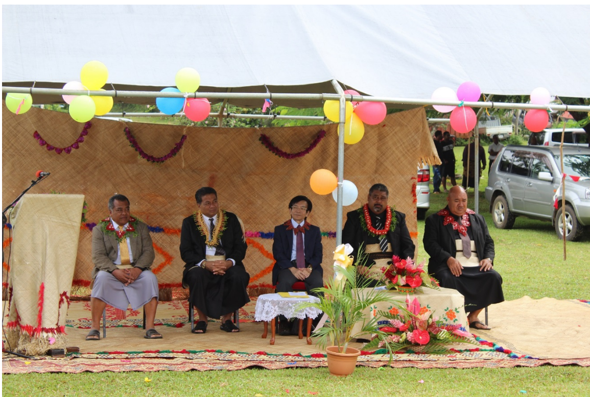
The Commissioning Ceremony for the PEC project in Pangaimotu, Vava'u on Thursday 19 April 2018