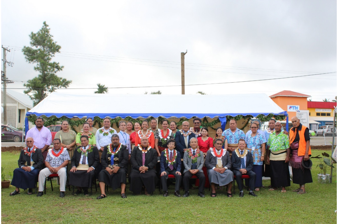
The Chief Guests at the Opening Ceremony for the Waste Authority New Office in Kameli, Vava'u on Wednesday 18 April 2018.