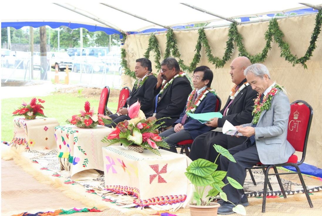
The Chief Guests at the Opening Ceremony for the Waste Authority New Office in Kameli, Vava'u on Wednesday 18 April 2018.