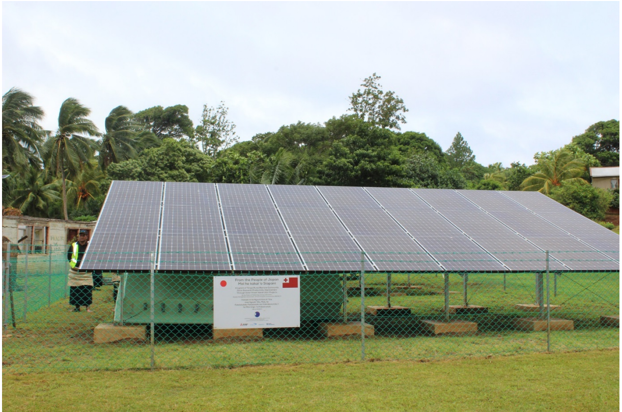
The Solar Power Generation installed in 'Otea Island funded under the project.