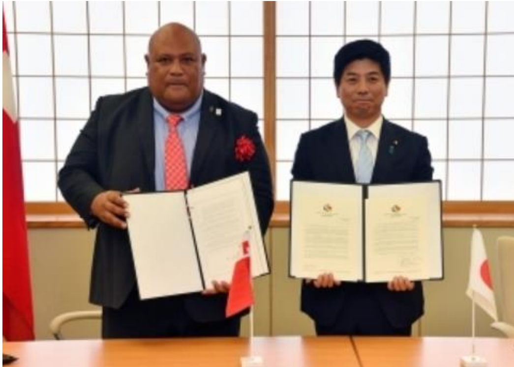
Mr. Kazuyuki Nakane, State Minister for Foreign Affairs of Japan with Hon. Semisi Kioa Lafu Sika, Deputy Prime Minister and Minister for Infrastructure and Tourism of the Kingdom of Tonga signed the exchange of notes for Japan's General Grant Aid for the Project for "Nationwide Early Warning System (NEWS) and Strengthening Disaster Communications" for Tonga on Wednesday, May 16 in Tokyo, Japan.