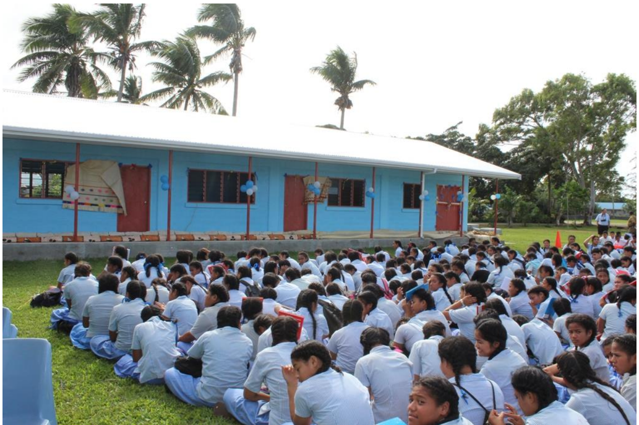
The new Technical and Vocational Education and Training Facility of 'Apifo'ou College, funded by the Government of Japan.