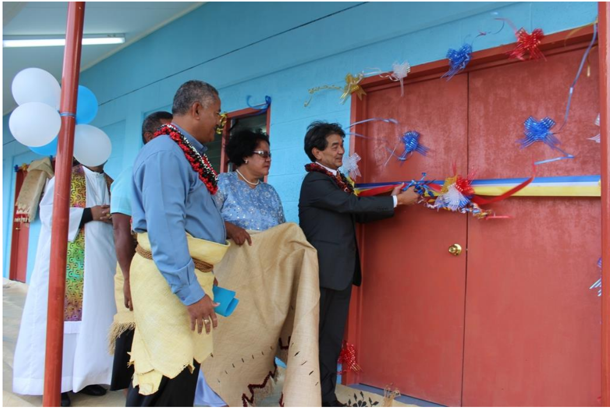
The commissioning ceremony held on Thursday, 9 June 2016.