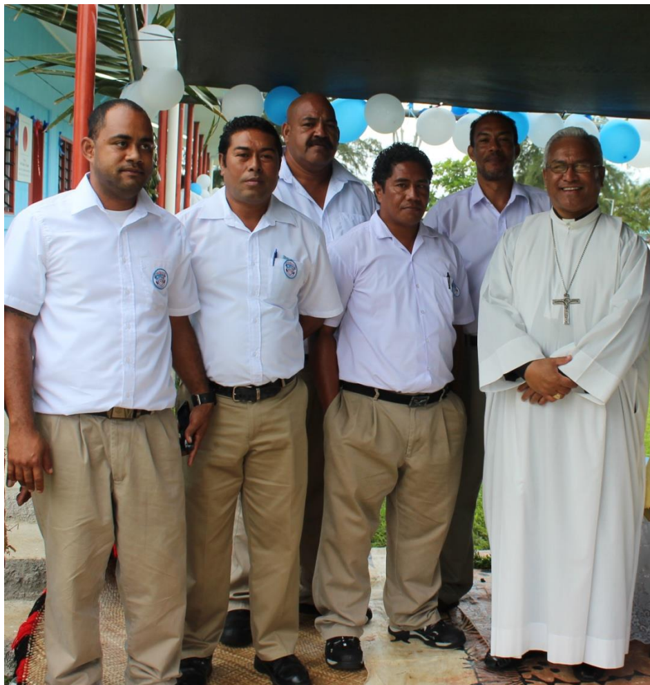
His Eminence Cardinal Mafi with TVET teachers of 'Apifo'ou College.