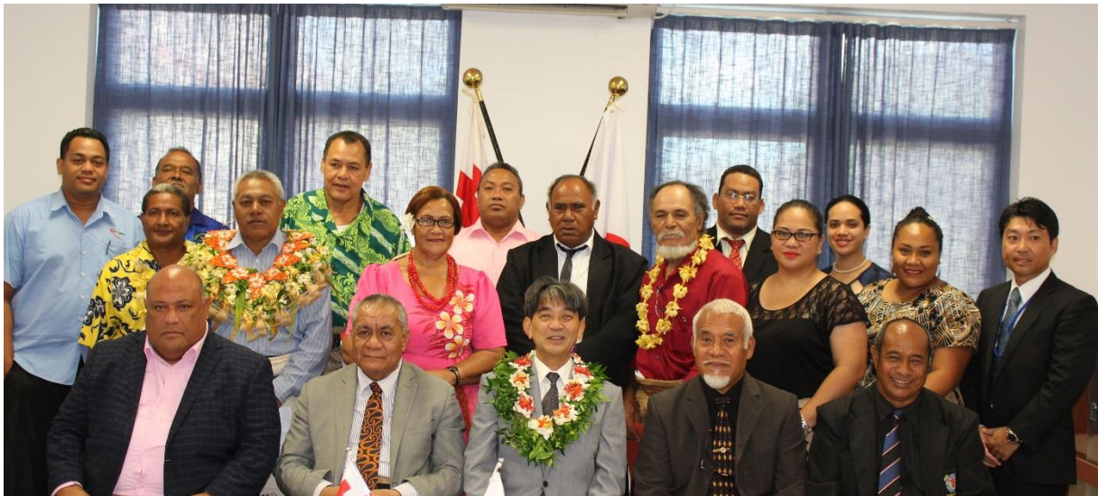
Grant Contract Signing Ceremony, Thursday 8 December 2016.