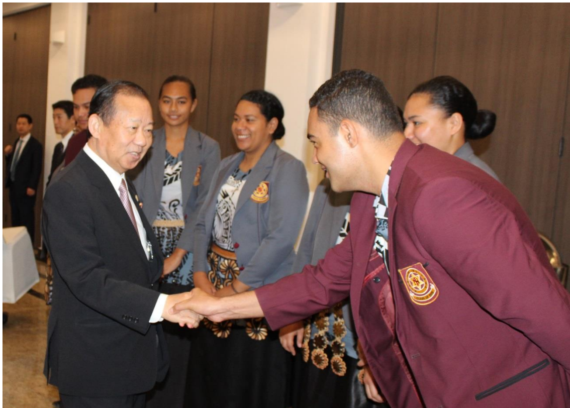
Mr. Toshihiro Nikai meeting Tonga High School Students who attended the "World Tsunami Awareness Day," summit last year in Kuroshio Town.