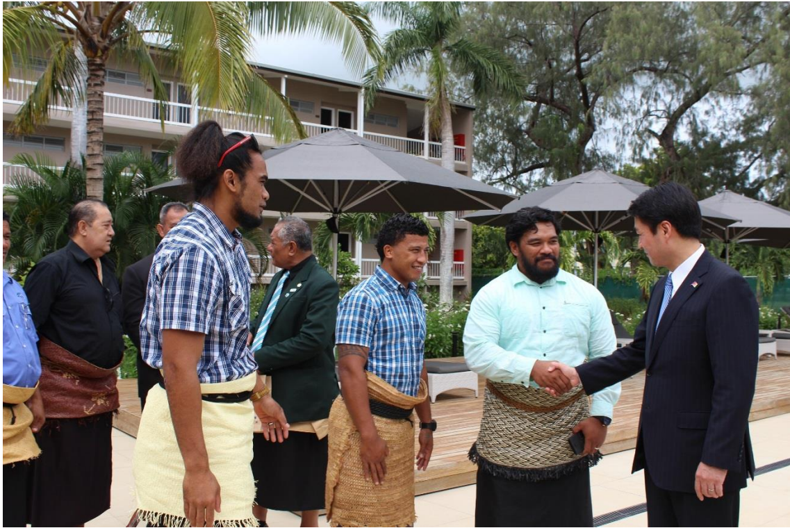
Governor Masanao Ozaki, Governor of Kochi Prefecture meeting Tonga Rugby Players at Tanoa International Dateline Hotel.