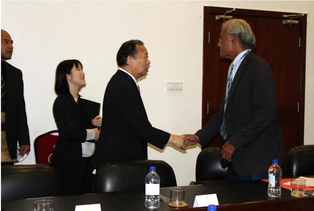
Mr. Toshihiro Nika, Secretary-General of the Liberal Democratic Party of Japan meeting Hon. 'Akilisi Pohiva, Prime Minister of Tonga during the Liberal Democratic Party Parliamentarian's Delegation visit to the Kingdom on Tuesday, 2 May 2017.