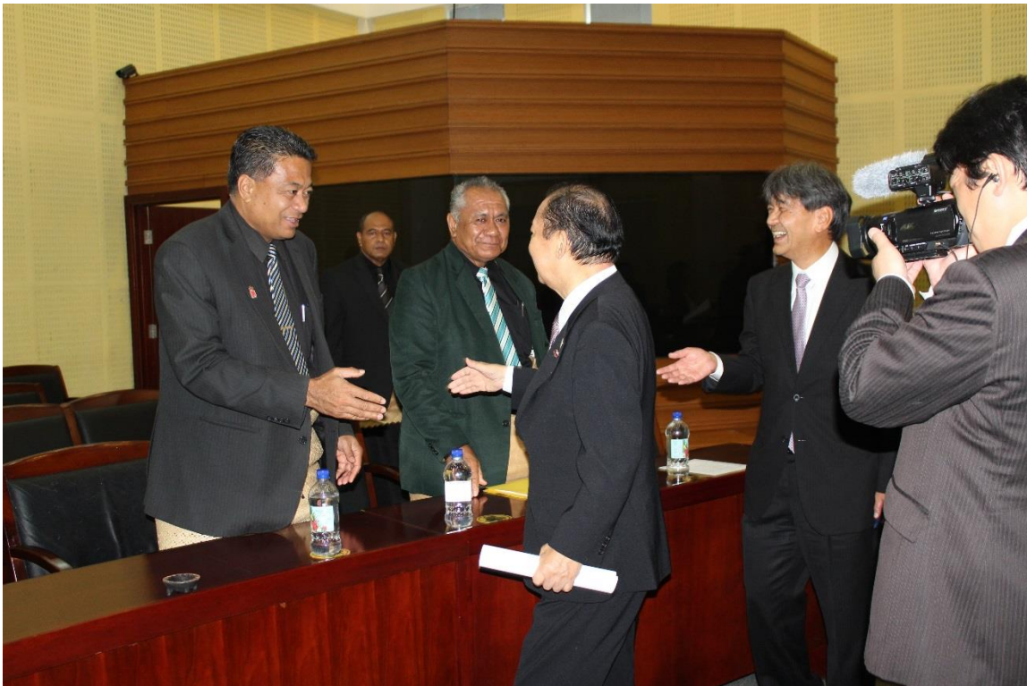
Mr. Toshihiro Nikai meeting Cabinet Ministers of Tonga during the Exchange of Note ceremony at the Fa'onelua Convention Centre in Nuku'alofa.