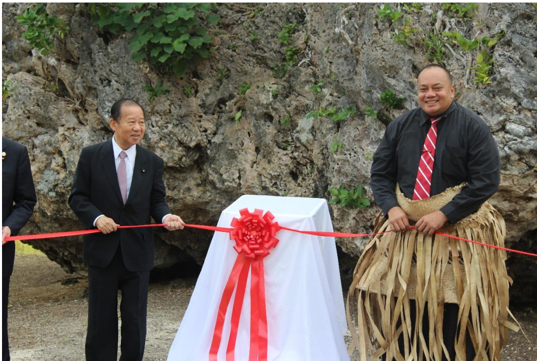
Mr. Toshihiro Nikai with Hon. Siaosi Sovaleni during the unveiling ceremony of the Maui's Stone Monument at Kala'au village on Tuesday, 2 May 2017.