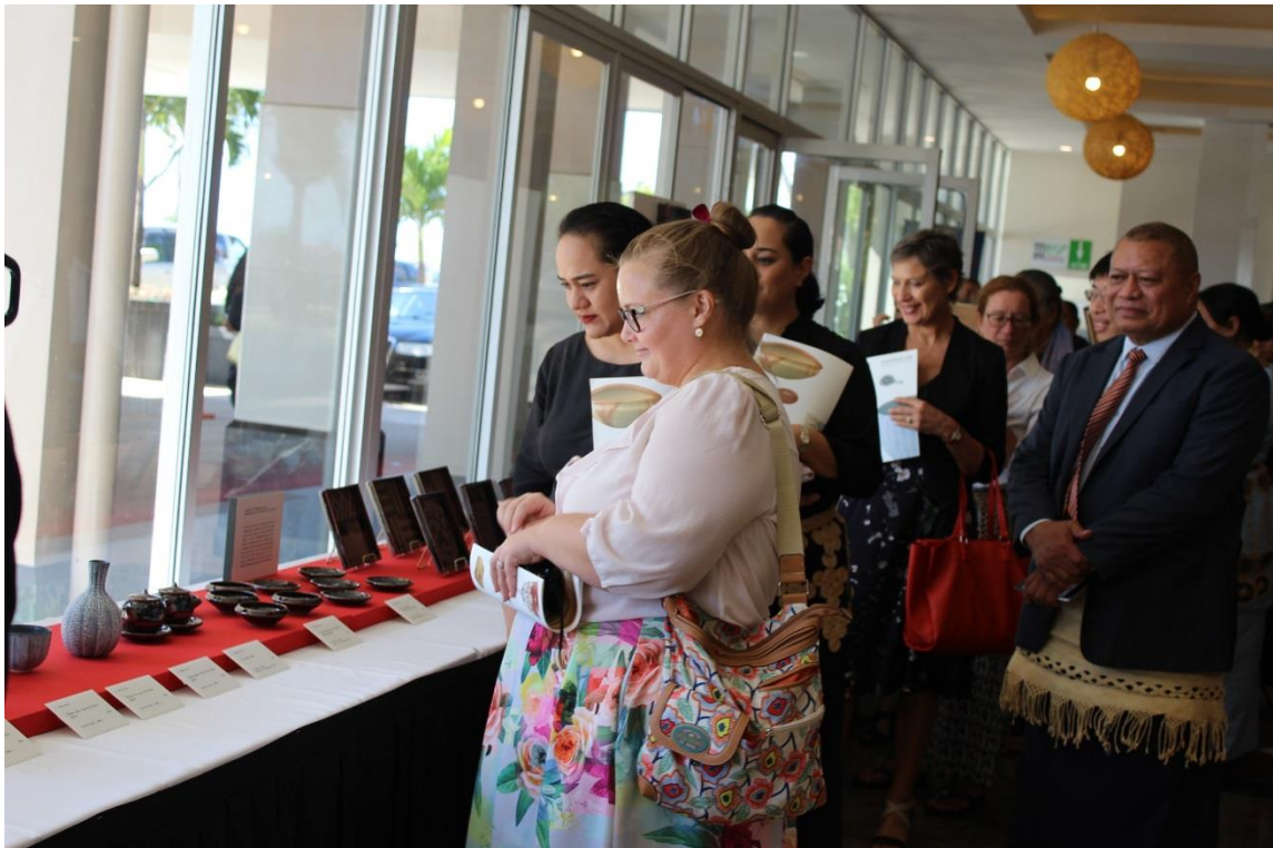
Invited guest viewing the Exhibition of Japan's handcrafted form on Thursday 20 July.