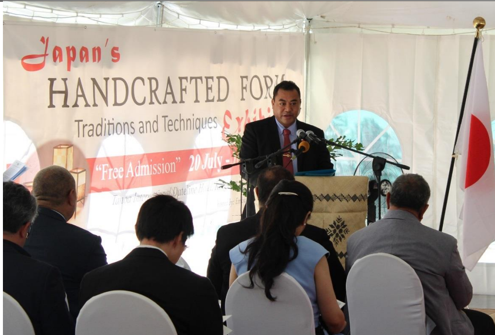
Hon. Mateni Tapueluelu, Acting Minister for Tourism with the keynote address at the Official opening of the exhibition.