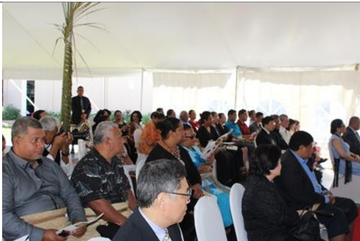
Official opening ceremony on Thursday 20 July 2017.