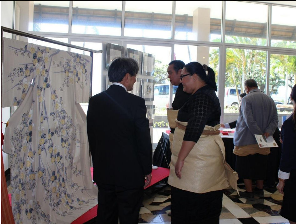
The Royal Chief Guest viewing a cloth-dyed-silk display at the Exhibition.