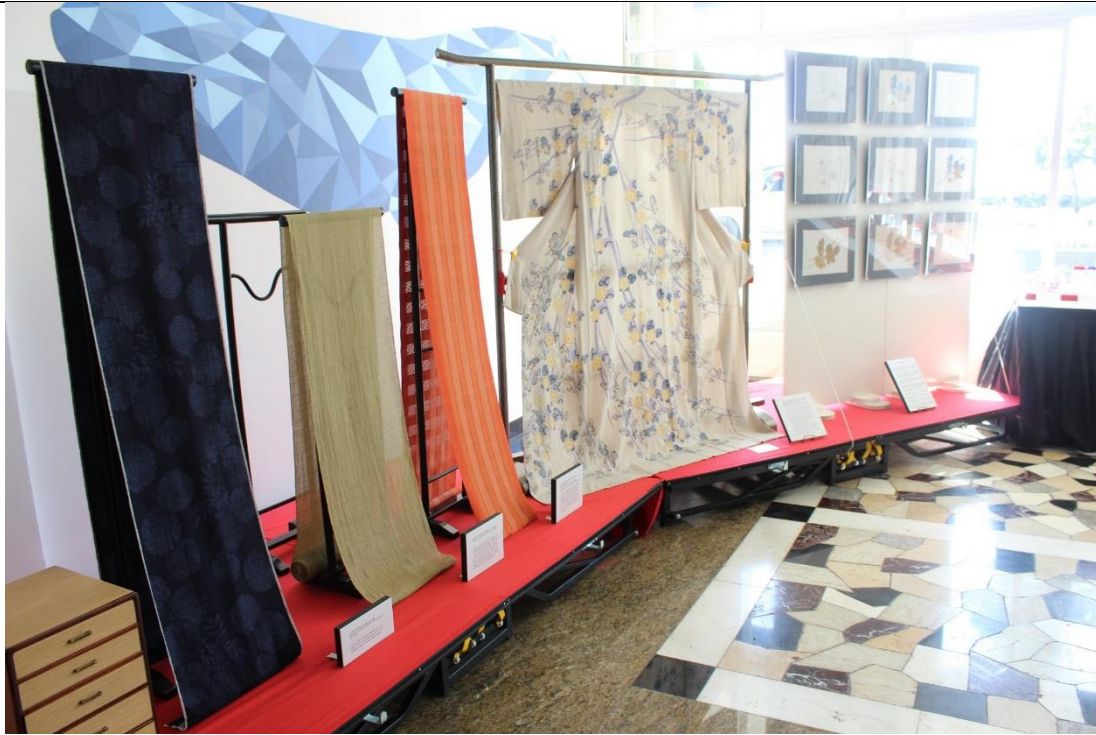
Textiles objects display at the Japan's handcrafted forms traditions and techniques exhibition.