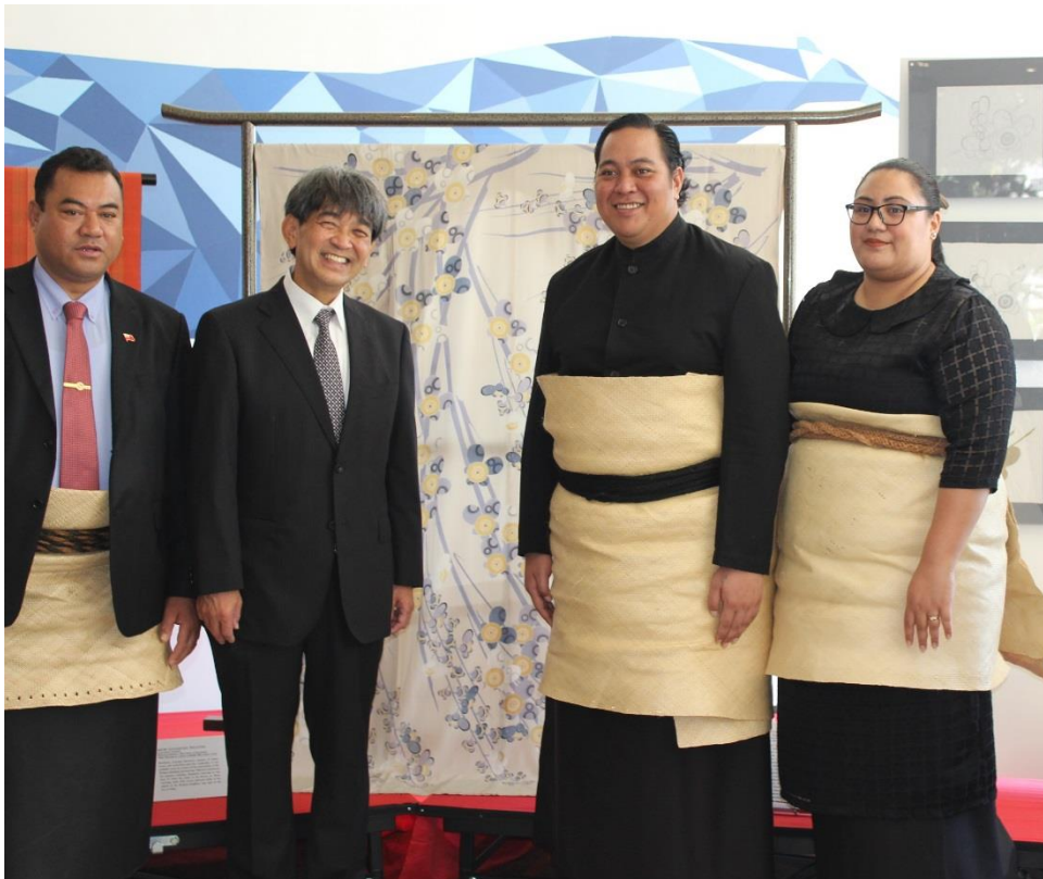
Their Royal Highnesses along with H.E Mr. Yukio Numata, Ambassador of Japan to Tonga and Hon. Mateni Tapueluelu, Acting Minister for Tourism.