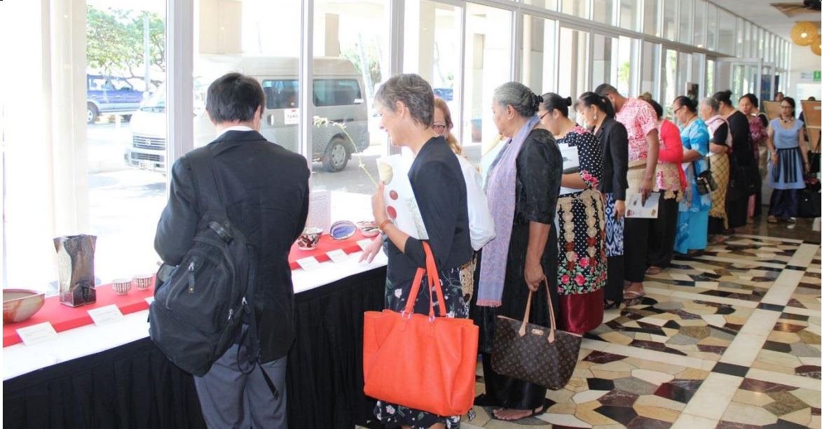
Invited guest viewing the Exhibition of Japan's handcrafted form on Thursday 20 July.