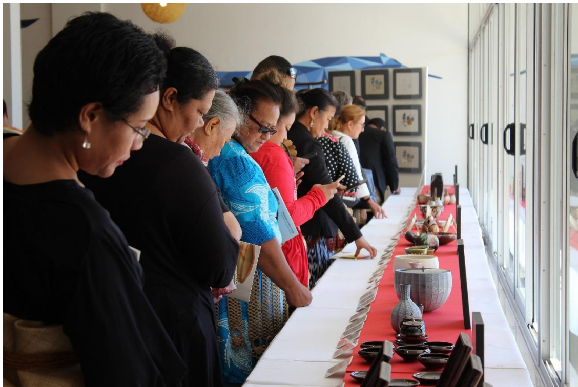
Invited guest viewing the exhibition of Japan's handcrafted form on Thursday 20 July.