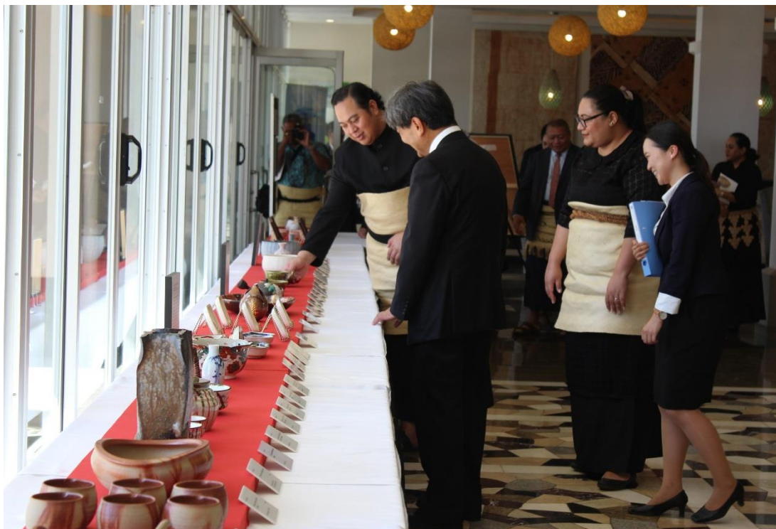
Their Royal Highnesses, Crown Prince Tupouto'a 'Ulukalala and Crown Princess Sinaitakala Tuku'aho at the official opening of the Japan's Handcrafted Form, Traditions and Techniques Exhibition at the Tanoa International Hotel on Thursday, 20 July 2017.