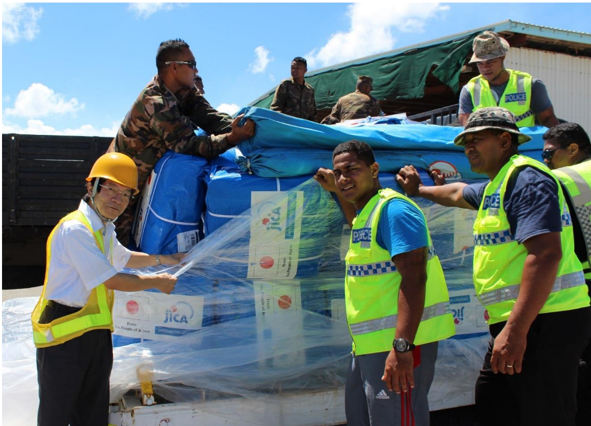
Japan's emergency relief goods arrived Fua'amotu Airport on Friday, 23 February 2018.