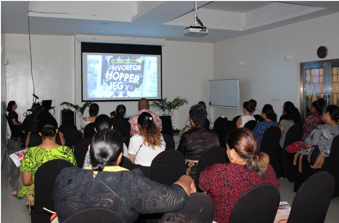
The film screening on Thursday night, 21 February 2019 at the Fiefia Room of Tanoa Hotel.