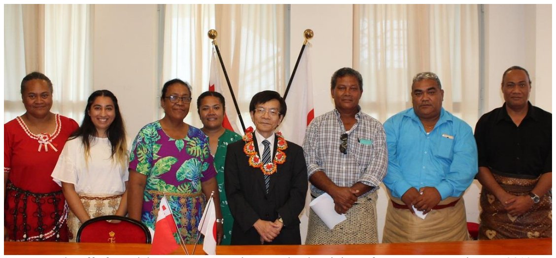
PTA and staff of Ha'alalo Government Primary School recipient of Japan's GGP assistance 2019.