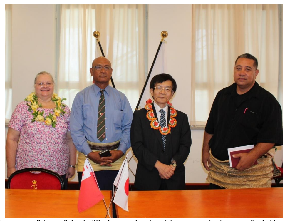
The Government Primary School of Fua'amotu also signed for an upgrade classroom funded by Japan's GGP on Tuesday, 10 December 2019.