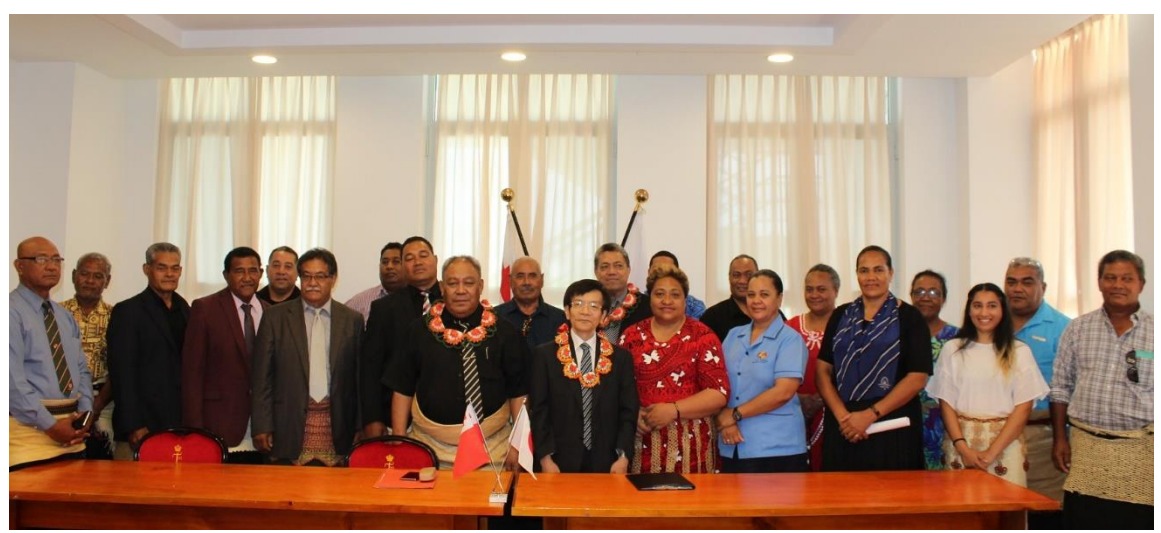
Recipient communities of Japan's GGP assistance at the signing ceremony on Tuesday, 10 December 2019 at the Ministry of Finance, conference room.