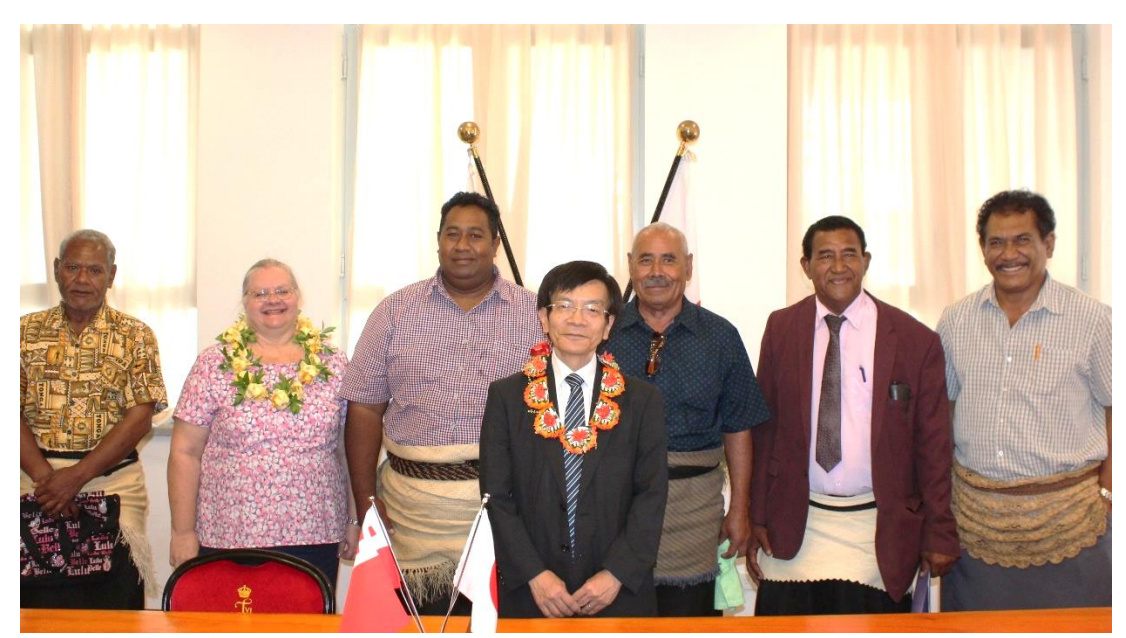
Hihifo district water committee received Japan's GGP assistance for an upgrade water pump system.