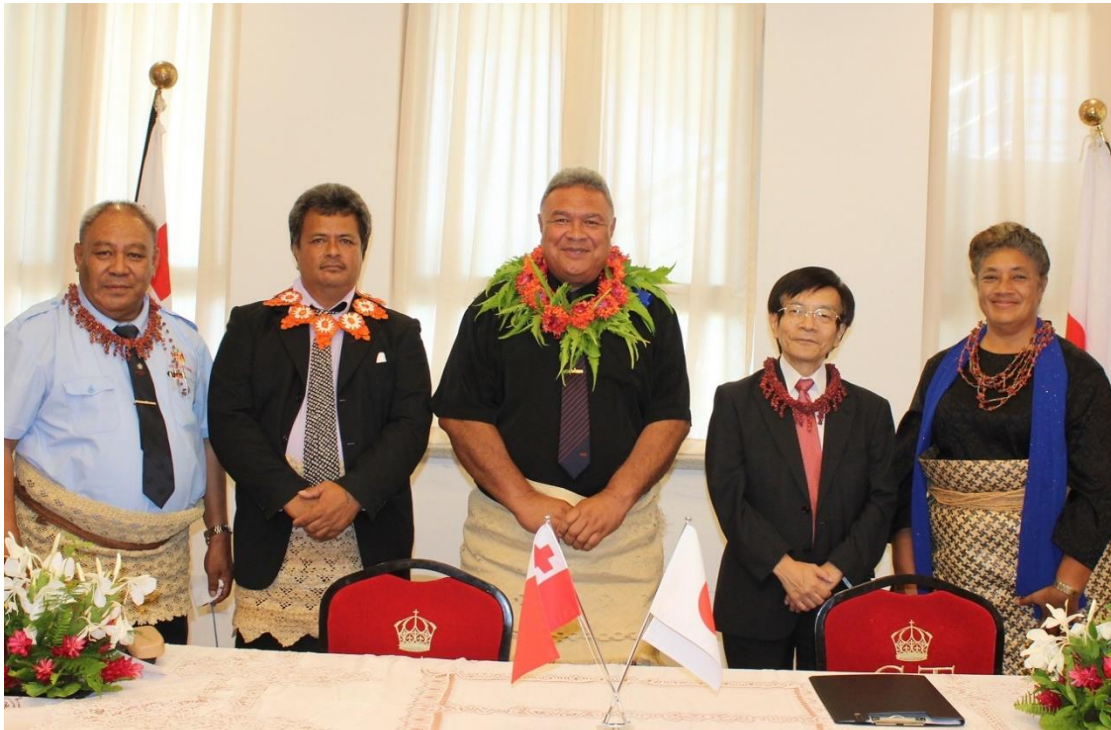
H.E. Mr. ISHII Tetsuya with signatories of Japan's GGP formalized on Wednesday, 26 February 2020 in Nuku'alofa along with Hon. Tevita Lavemaau, Minister for Finance and Minister for Revenue and Customs.