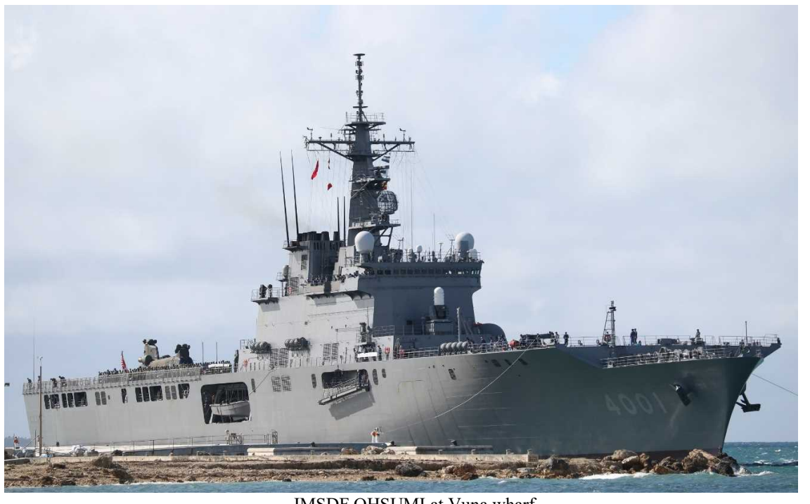
JMSDF OHSUMI at Vuna wharf.