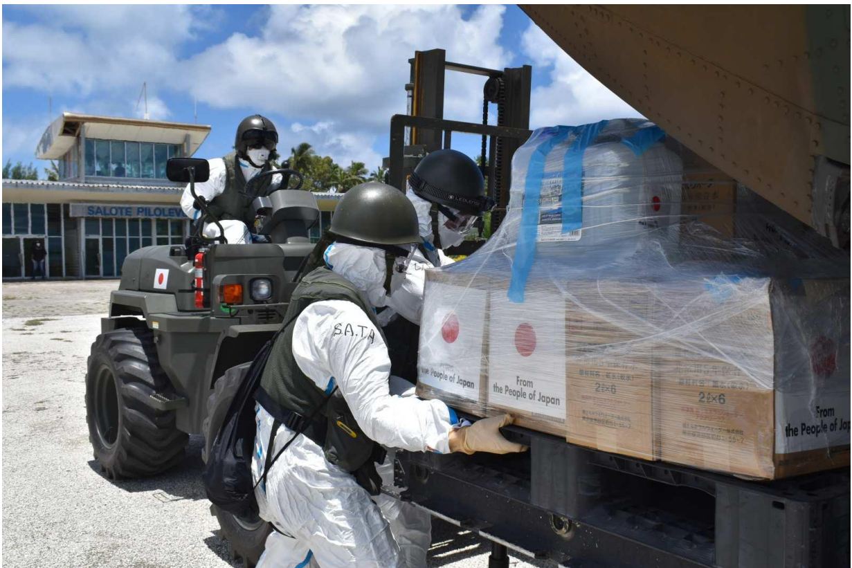
JGSDF unloaded the consignment of drinking water