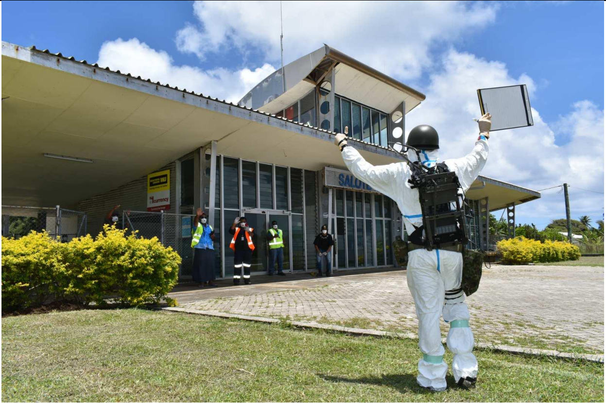
JGSDF unloaded in contactless manner