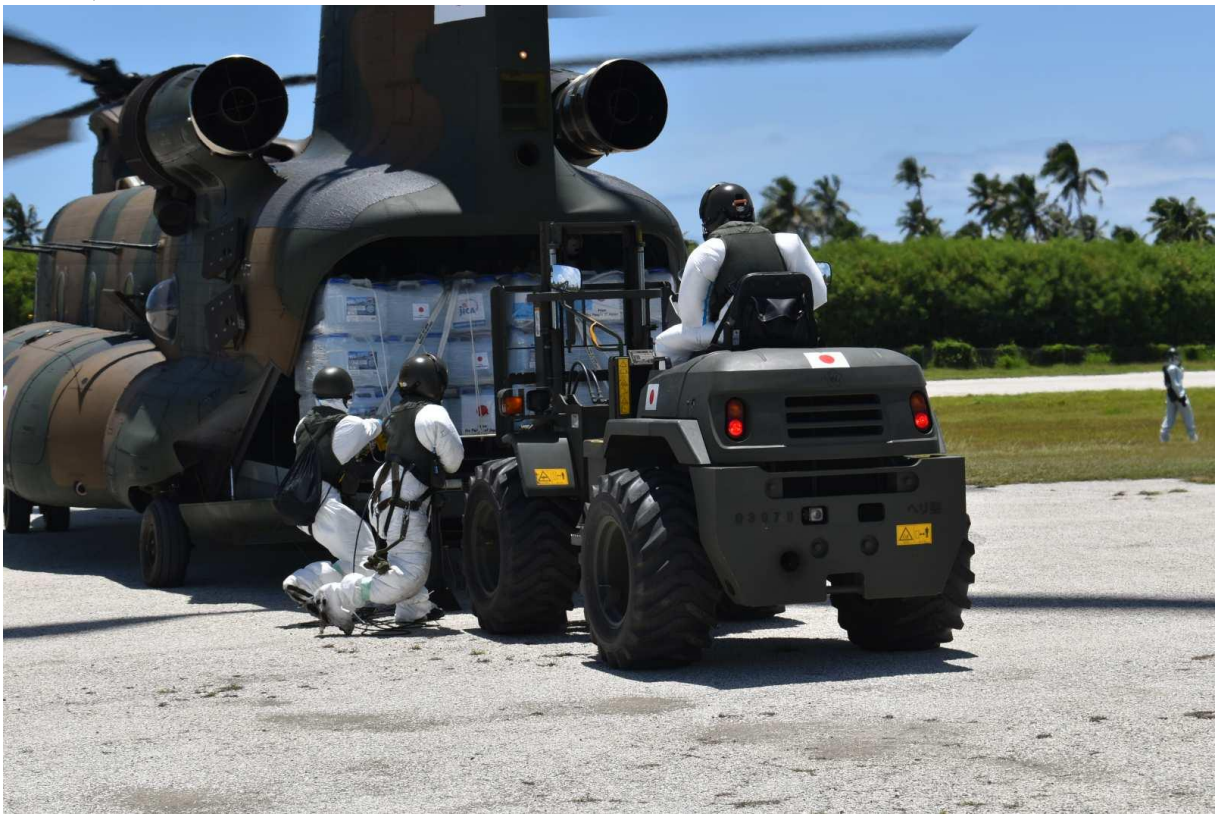
JGSDF CH-47 helicopter arrived in Ha'apai to deliver drinking water