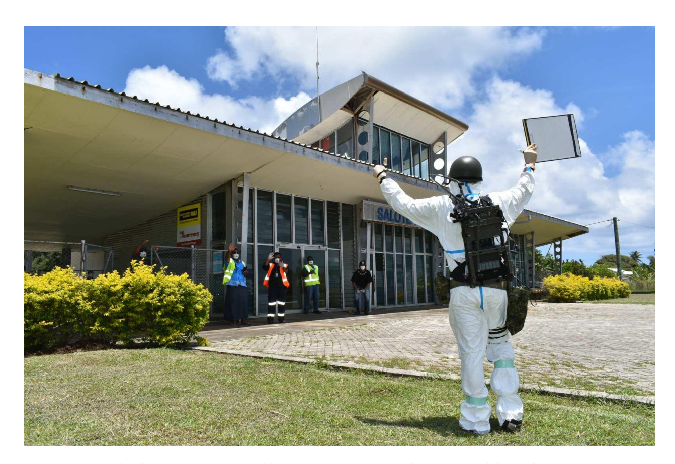
All deliveries were conducted in a contactless manner guided by the Ministry of Health