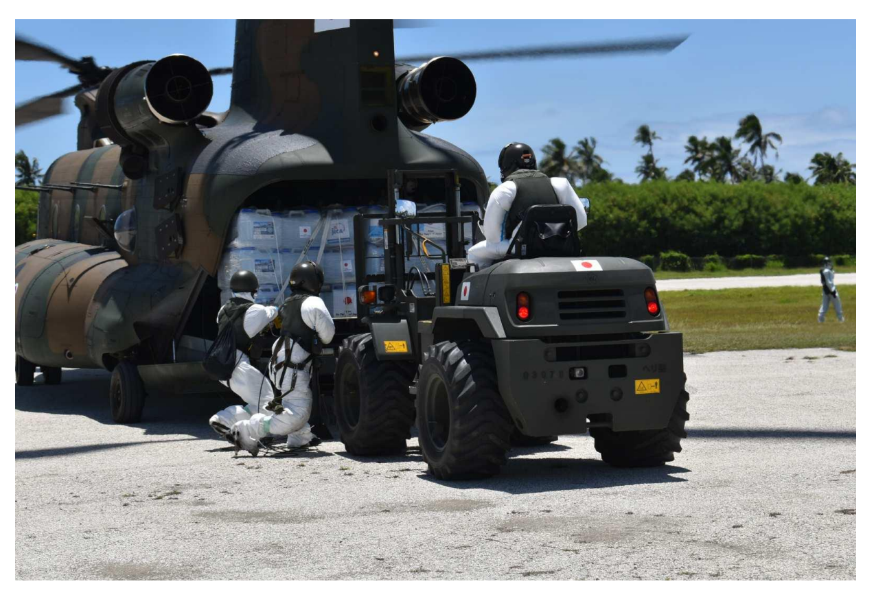
Japan Ground Self-Defense Force helicopter CH-47 delivered drinking water produced in "OHSUMI" to Ha'apai on 15 February