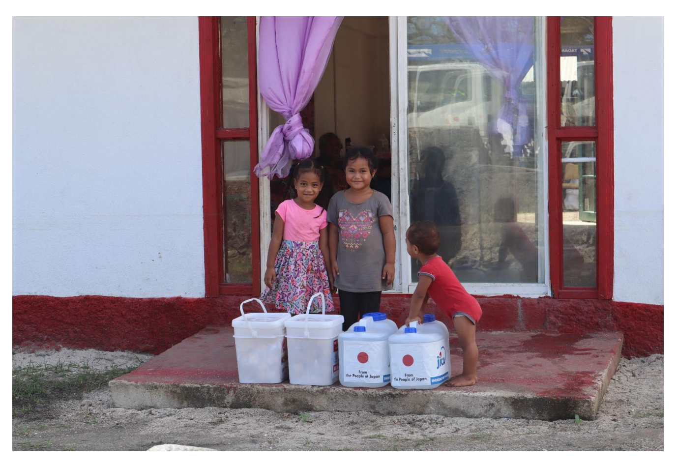
The people in Kanokupolu received Japan's assistances including drinking water, shovels, jelly cans