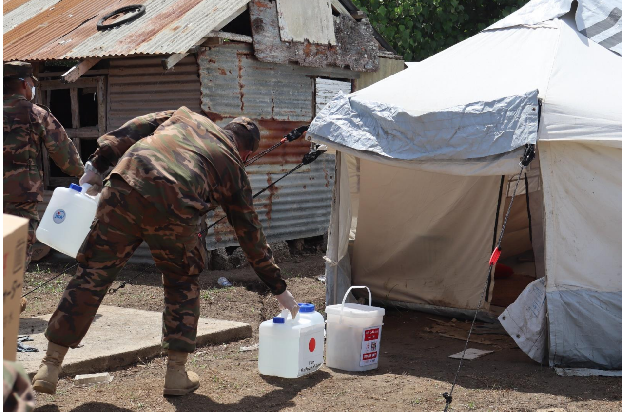
Satff of NEMO, HMAF, and Tonga MORDI Trust delivered Japan's emergency assistances in Aha'u, Kanokupolu, and Ha'atafu.