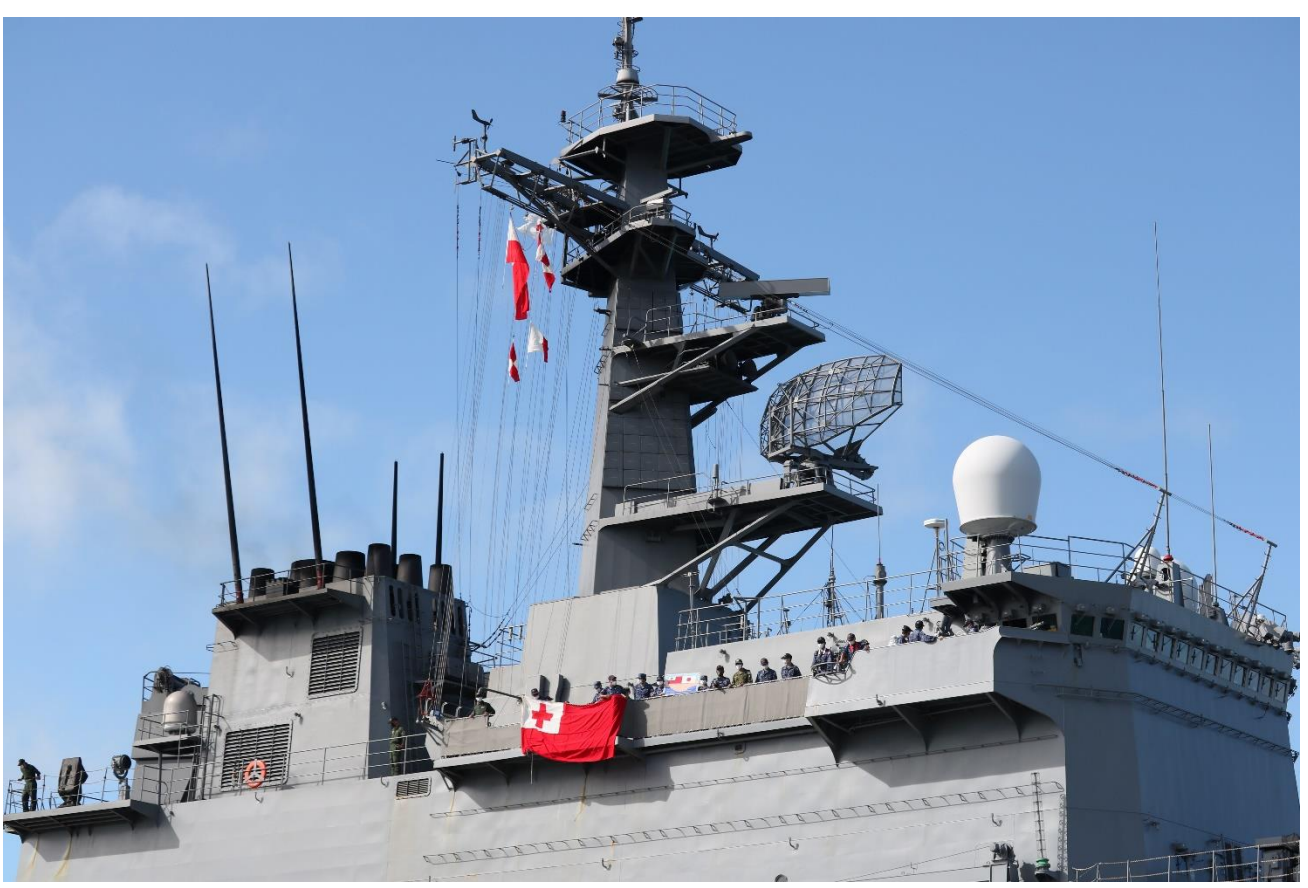
The Japan Maritime Self Defense Force "OHSUMI" arrived in Tonga on 9 February 2022 with emergency relief supplies