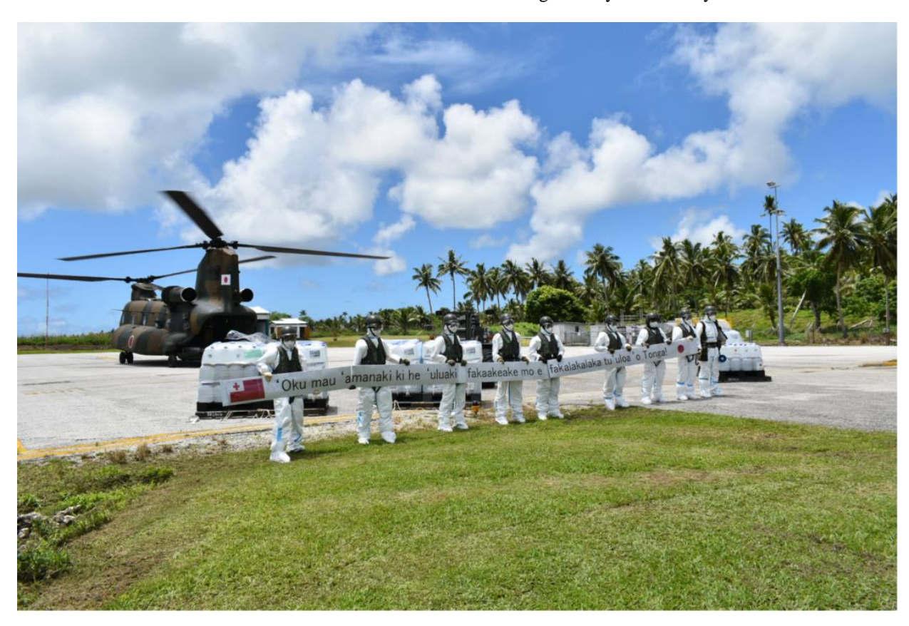
The Japan Grand Self Defense Force delivered the warm messages to the people in Vava'u on 16 February