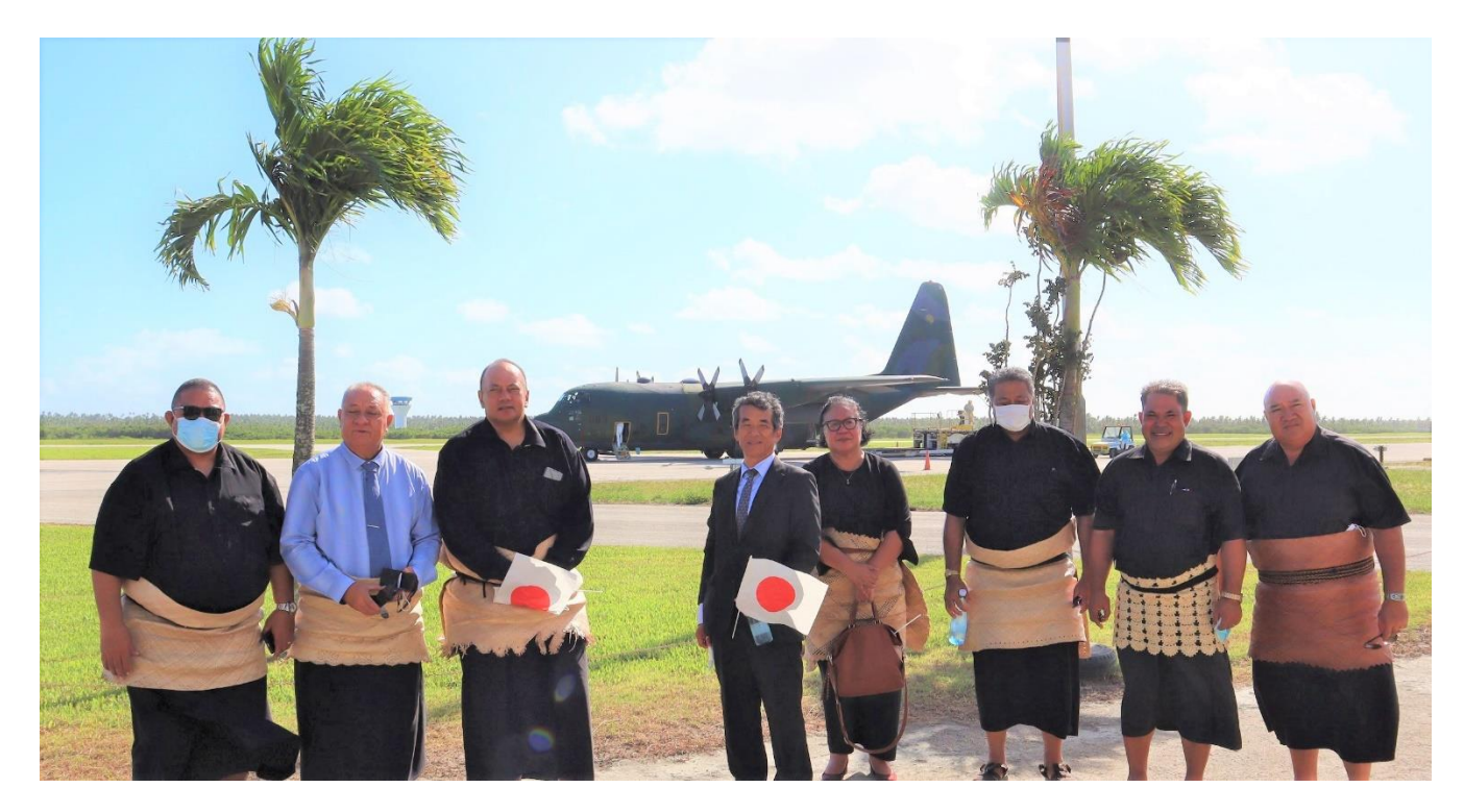
H.E. Mr. MUNENAGA, Ambassador Extraordinary and Plenipotentiary of Japan to the Kingdom of Tonga and Hon. Hu'akavameiliku, Prime Minister of Tonga welcomed the arrival of the first Japan Air Self Defense Force aircraft C-130 at the Fu'amotu Airport on 22 January 2022.