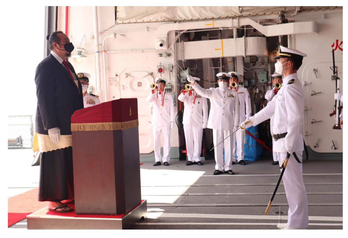
His Royal Highness Crown Prince Tupouto'a 'Ulukalala received the Salute of a Guard of Honor from JMSDF