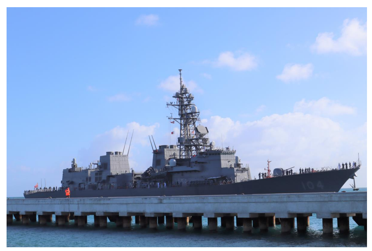
Arrival of JMSDF KIRISAME at Vuna Warf