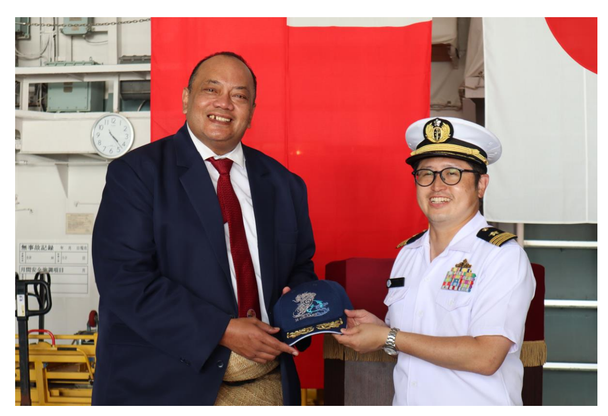
The Prime Minister, Hon. Hu'akavameiliku and a staff of JMSDF