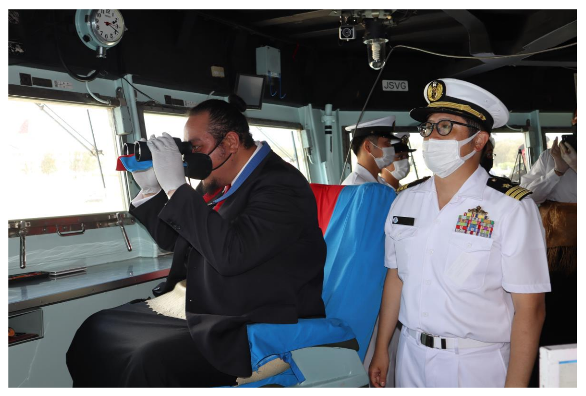
His Royal Highness Crown Prince Tupouto'a 'Ulukalala and CDR. SAKATA Commander of KIRISAME