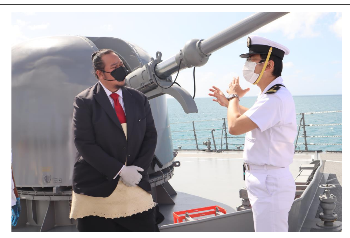
His Royal Highness Crown Prince Tupouto'a 'Ulukalala and a staff of JMSDF