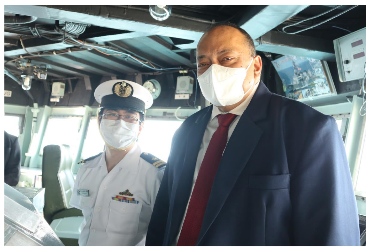
The Prime Minister, Hon. Hu'akavameiliku and a staff of JMSDF