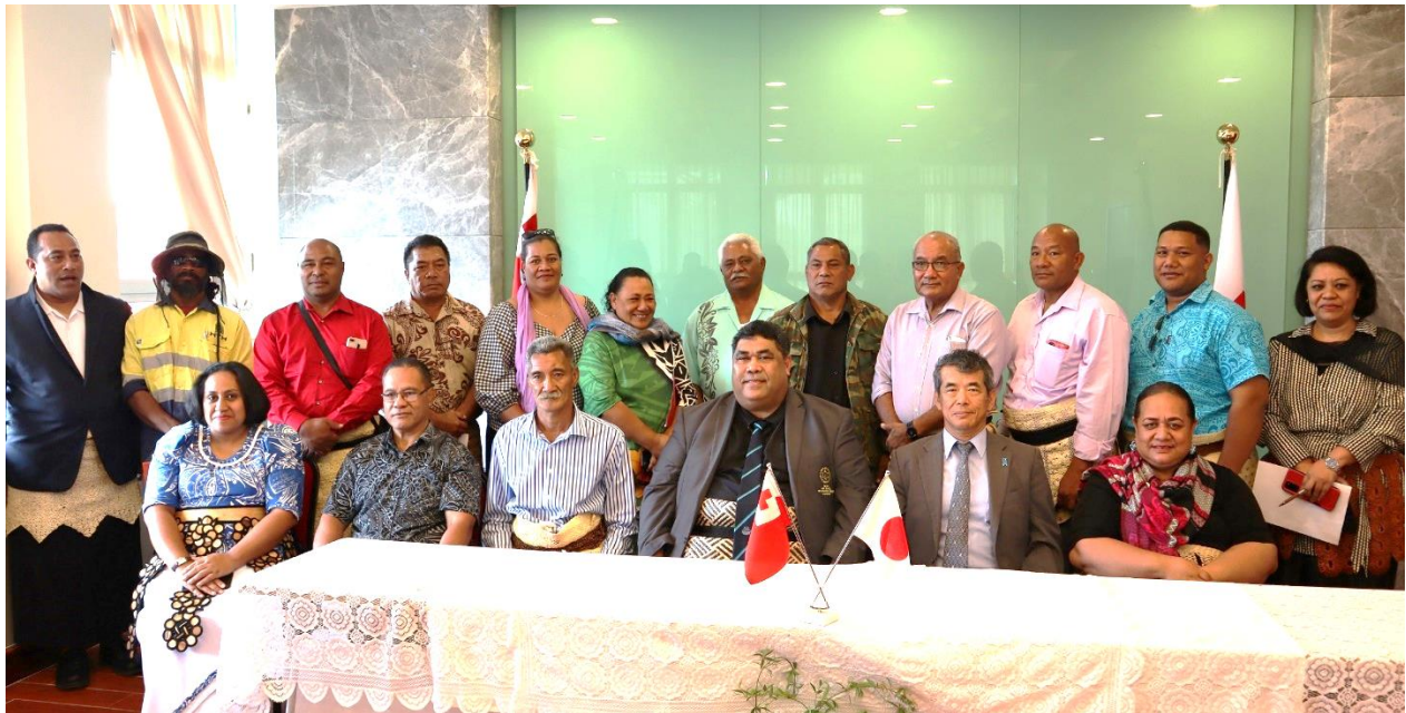
Japan's GGP Signing Ceremony, Friday, 25 August 2023 at the Conference Room, Ministry of Finance, St. George Building.