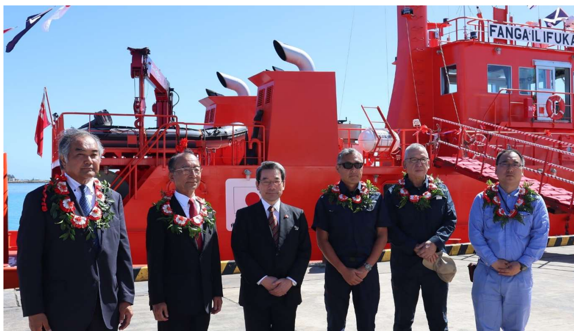
Japanese engineers of the new tugboat arrived Nuku'alofa for the commissioning ceremony.

For further enquires please contact the Embassy of Japan in Tonga. Level 5, National Reserve Bank of Tonga Building / Telephone: 22-221