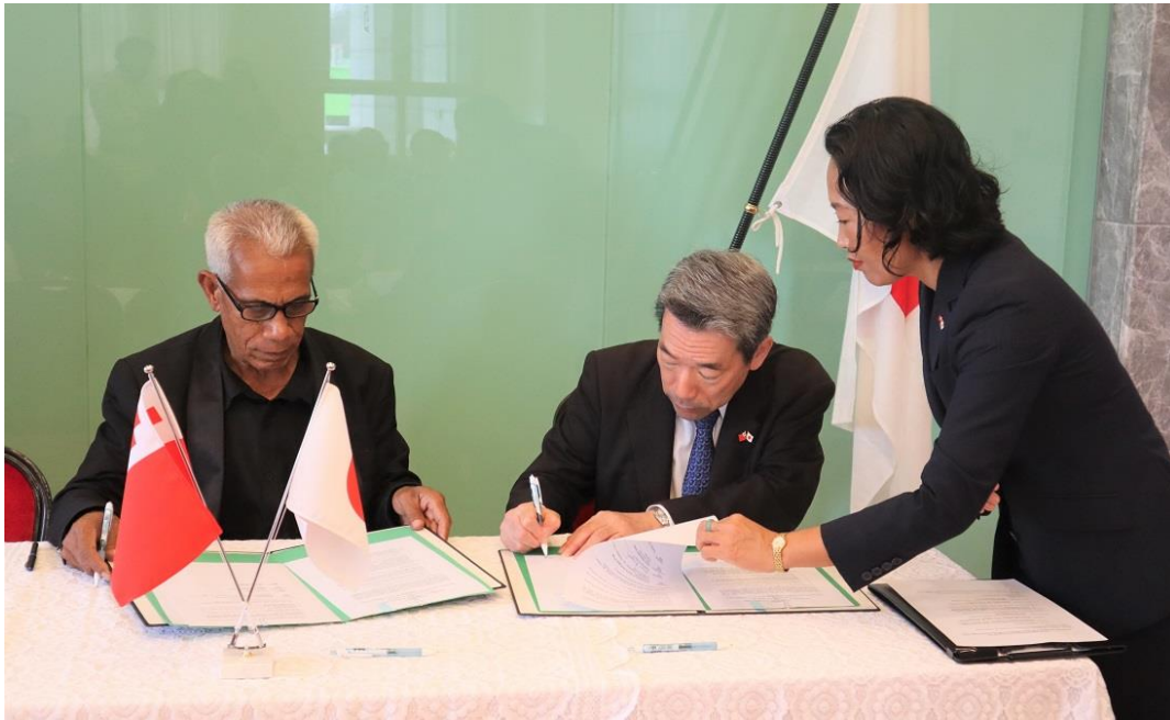
Grant contract formalized for upgrading of the Water Supply System for 'Utulau village.