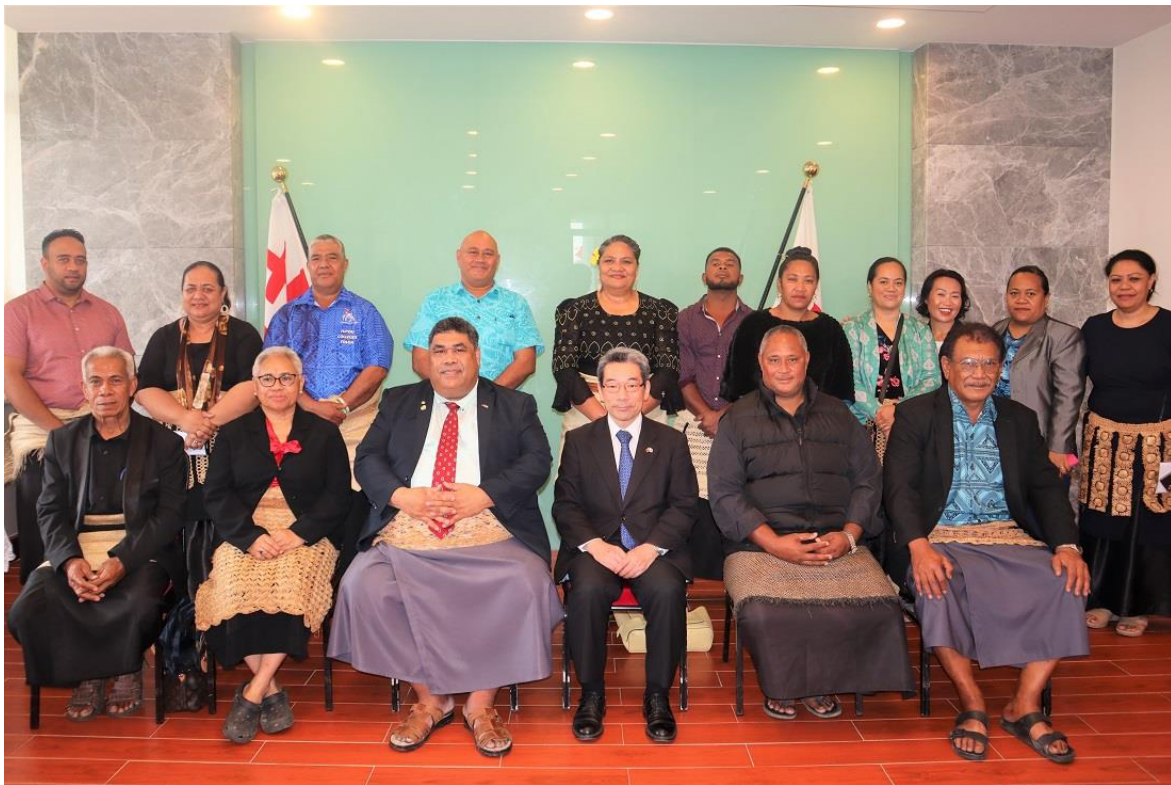
Japan's GGP signing ceremony on Tuesday, 10 September at the Conference Room, Ministry of Finance in Nuku'alofa.

For further enquires please contact: Embassy of Japan in Tonga. Level 5, National Reserve Bank of Tonga Building / Telephone: 22-221