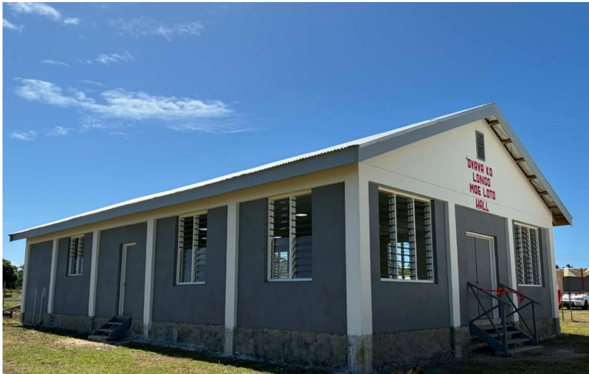
Japan's GGP for Koulo Village's first evacuation centre and community hall