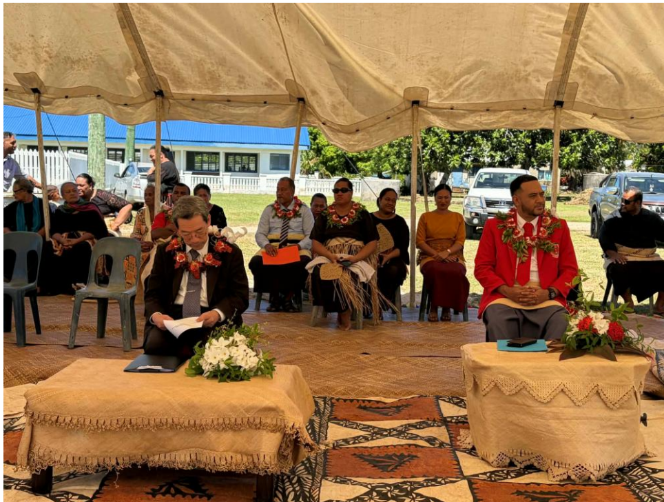
The handover ceremony at Koulo village, Ha'apai on Wednesday, 1 April 2026.