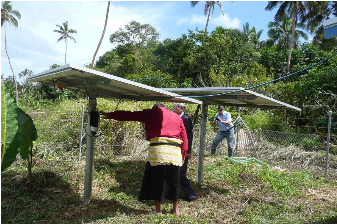
Solar system for Holonga Village Water Supply, 25 th September 2014