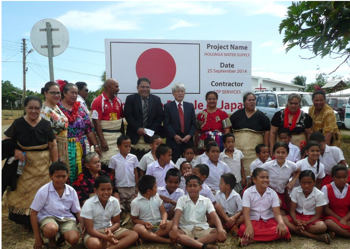
Commissioning Ceremony for Holonga Village's upgrade water supply system, 25 th September 2014